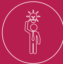
Personal Finance Consultant